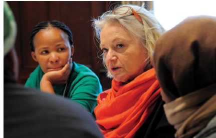
Above, from top: Community members in Guanajuato, Mexico, who benefit from the work of a foundation led by a Synergos Senior Fellow; discussion at global symposium on overcoming social isolation.