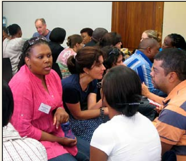
Top: Children who benefit from the work of the Foundation for Community Development in Mozambique.

The initial phase of work involved delivery of community-based services to 9,000 children in distress and the piloting of integrated, community-rooted approaches that build on local traditions of child care. In April 2010, the partnership entered a second phase under the name Imbeleko, an African word connoting various ways of nurturing infants. The project is testing integrated approaches at several sites in Mozambique and in South Africa, and seeks to influence policy makers and government agencies to adopt more effective strategies for children.