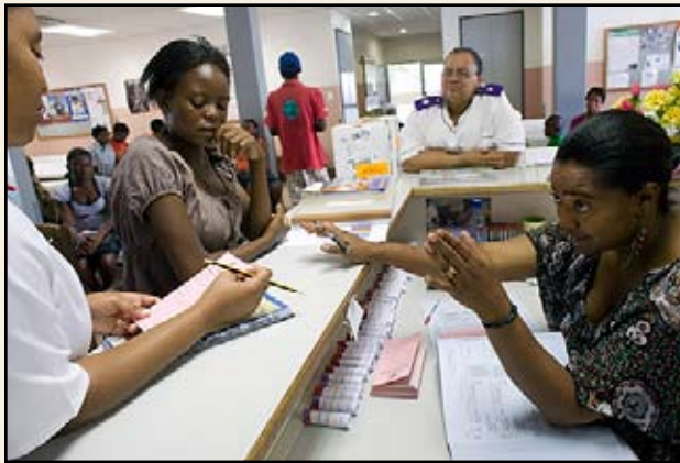
Ante-natal care clinic in the Katutura State Hospital in Windhoek.

In a partnership funded by the Bill & Melinda Gates Foundation, Synergos, Namibia's Ministry of Health and Social Services, McKinsey & Co., and the Presencing Institute are developing a model to improve health leadership and service delivery that can be