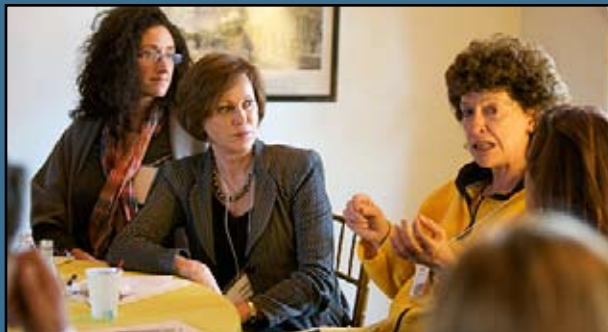
Left Discussion among GPC members at a network event.