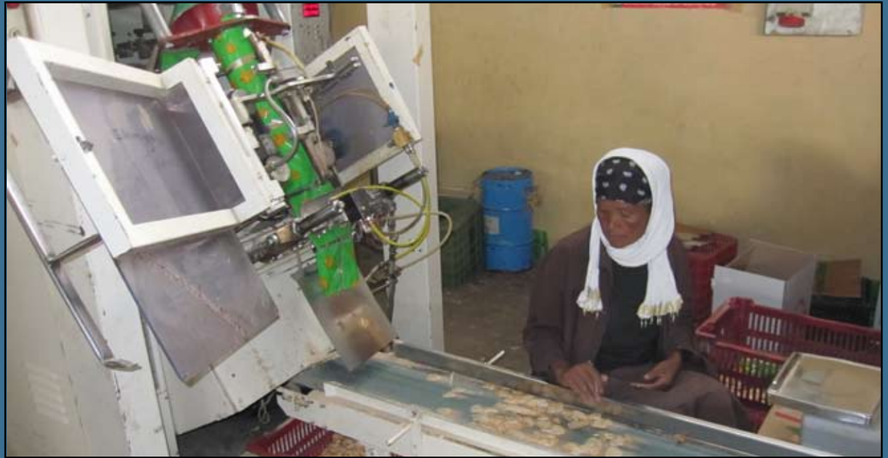
Synergos Consulting Services builds upon our expertise and strong networks in Africa, Latin America, Asia, and the Middle East.

We also identified potential partners and thought leaders in social areas of interest to the company: women, the environment, indigenous people, water and education.