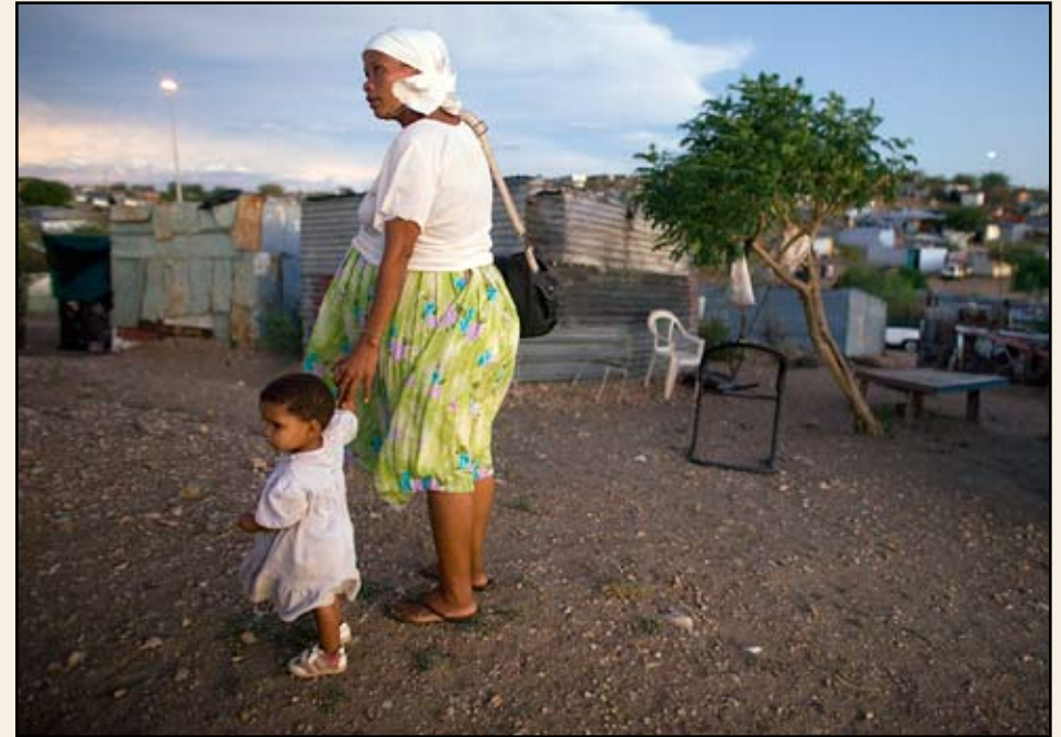
Our partnership in Namibia focuses on improving maternal and child health.

Synergos is extending the innovation process to other regions of Namibia, and we are also supporting the government and other stakeholders to incorporate a focus on child nutrition through a new partnership, the Namibian Alliance for Improved Nutrition-NAFIN.