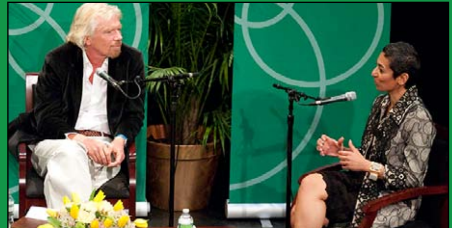
Top: Discussion on participatory governance organized by Synergos for H.E. Benigno Aquino III, President of the Philippines.