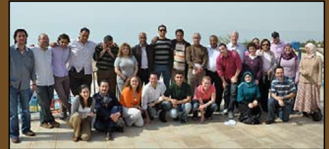
Our first class of Arab World Social Innovators consisted of 22 exceptional leaders from Egypt, Jordan, Lebanon, Palestine, and Morocco.

A closing evaluation showed that the Innovators increased their organizational capacity, are serving more beneficiaries, and have expanded their initiatives or launched new ones. The positive impact of the program has prompted Synergos to launch a second round, for 15 new Arab World Social Innovators, and to explore other approaches to fostering social innovation in the coming years, including a more extensive country-level program in Egypt.