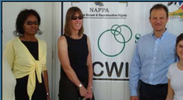
Above left: GPC learning journey in Namibia.