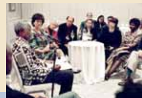
March 2002 GPC Members meet with Nelson Mandela to hear his personal account of life in prison and reconciliation

The Circle’s membership includes more than 200 active participants from approximately 70 families representing more than 20 countries from the U.S., Europe, Latin America, Australia, Asia and Africa. Circle members are extraordinary change makers who lead, implement, and support innovative initiatives addressing the most significant challenges linked to poverty and social injustice. To honor the privacy of our members, the network provides a “safe space” with a non-solicitation policy; members’ names are not distributed to the media or publicized without permission.