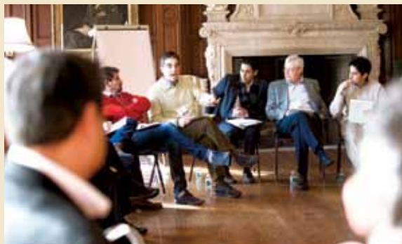
Discussion during the Annual Gathering at the Rockefeller Family Estate

Synergos’ problem-solving approach addresses the root causes of poverty and social justice. We address critical development challenges, such as child under-nutrition in India, Aboriginal community development in Canada, food security in Ethiopia, social innovation in the Middle East, public health leadership in Namibia, and vulnerable children in Southern Africa.