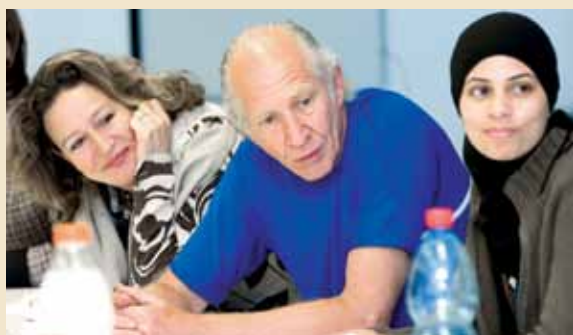
An informative meeting during a Learning Journey in the Middle East