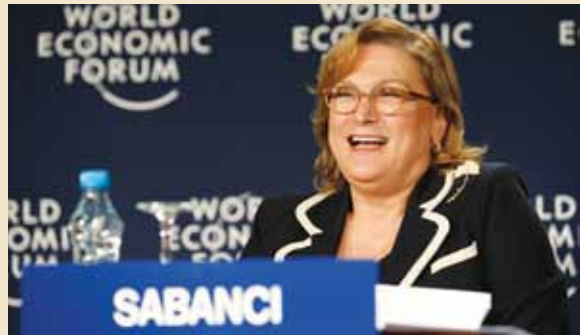
GPC Member Güler Sabancı, advocate of women and girls, speaks at the World Economic Forum in Turkey