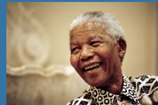
2002 GPC Members meet with Nelson Mandela to hear his personal account of life in prison and reconciliation.

2002 The Hewlett Family hosts GPC Members at their ranch for discussions about global philanthropy with Graça Machel.