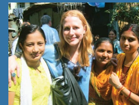
2003 The GPC forms a Next Gen group for the rising generation of philanthropists.