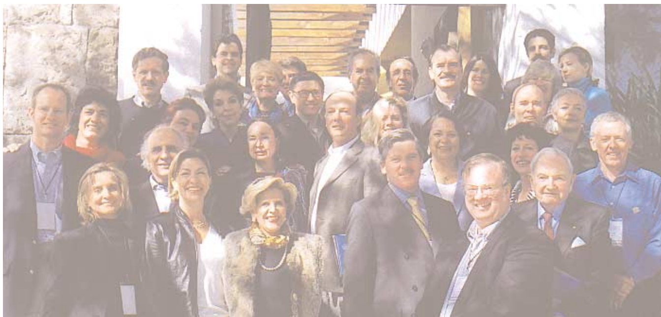
The group with the President and First Lady of Mexico, following breakfast and discussion at the Fox's ranch outside Guanajuato.