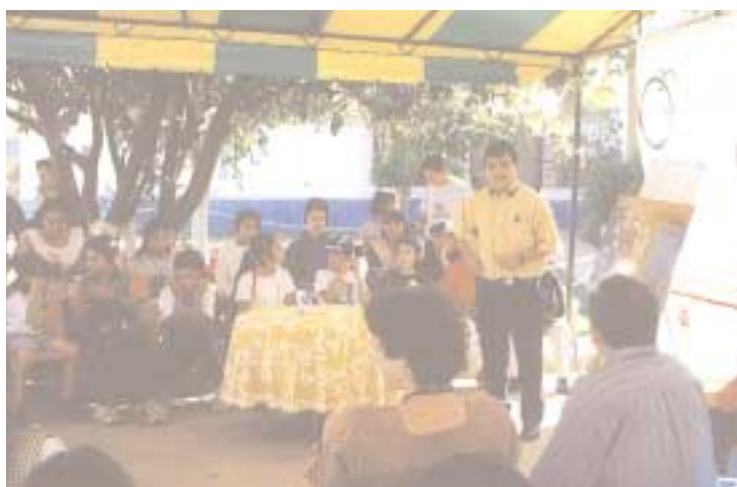
Staff of CENTEOTL describing the organization's work and impact.

CEPCO has played a critical role for more than a decade in opening fair trade market options for more than 20,000 small producers, particularly those producing organic coffee. By negotiating long-term fixed price contracts, they have been able to