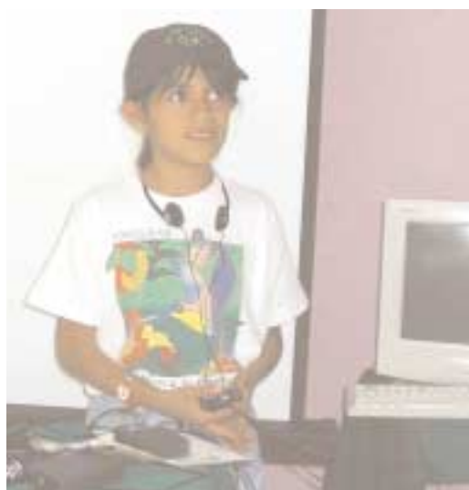
Participants at the site visit to CENTEOTL organized by the Vamos Foundation included children active in environmental education. This girl gave a presentation on how she and her family are involved in CENTEOTL's work.

Our time in Oaxaca concluded with a discussion hosted by Vamos about the role and capacity of diverse local actors to promote sustained and effective social change and development in Oaxaca. This discussion featured 15 representatives of